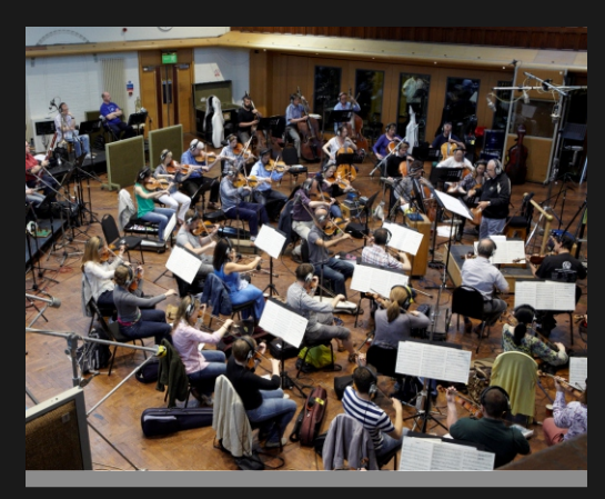
The London Symphony Orchestra