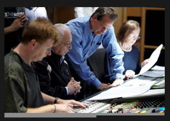
Air Studios, London